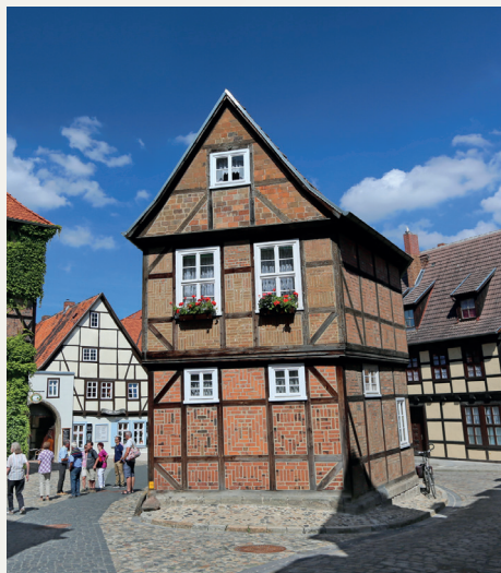
/// UNESCO-World Heritage City Quedlinburg