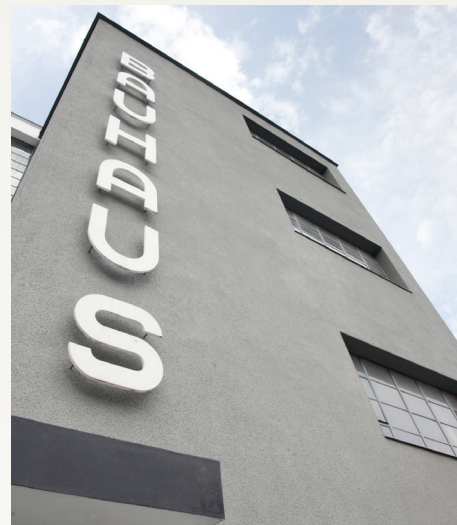
/// Bauhaus in Dessau-Roßlau