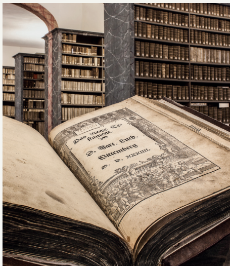
Luther Bible, Francke Foundations Halle (S)