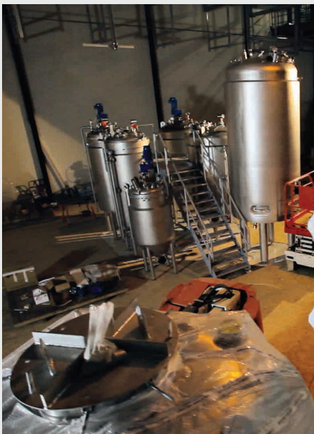
/// Fraunhofer Center for Silicon Photovoltaics CSP