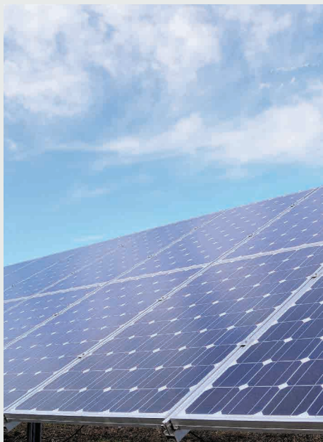
/// High quality products made in SOLAR VALLEY