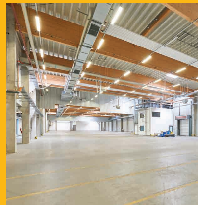
/// Sun-Park (approx. 70,000 sqm)

SOLAR VALLEY: TECHNOLOGY CENTRE MIDDLE-GERMANY. THE PERFECT LOCATION FOR INVESTMENTS IN HIGH-TECH-PRODUCTION.