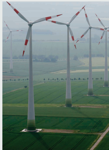
/// Windpark Druiberg GmbH & Co. KG