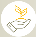
RAW MATERIAL/ MATERIAL EFFICIENCY