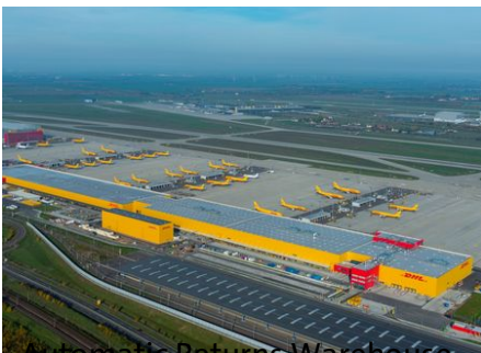
Air Freight Hub