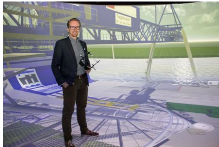
PortForward – the digital port