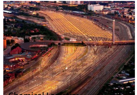
Train Formation Depot