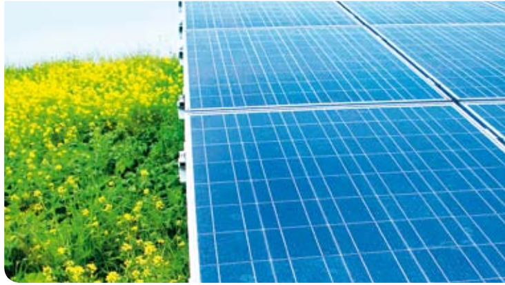
Solar field in the Solar Valley