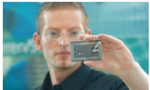
Fraunhofer Institute for Factory Operation and Automation (IFF) in Magdeburg

The LogMotionLab at the Fraunhofer Institute IFF is a laboratory for the development, testing and certification of state-of-the-art identification technologies (RFID and telematics). The mobile, thus flexibly deployable components of the laboratory enable functional tests directly at the customer under real operational conditions. The LogMotionLab is equipped with almost any identification and positioning system that currently exists on the market or in development.