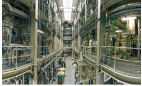
Polymer synthesis and processing in pilot scale in the Fraunhofer PAZ, Schkopau