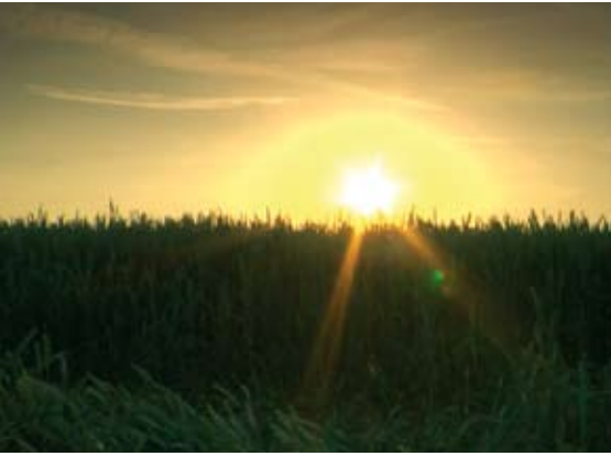
In the land of early risers