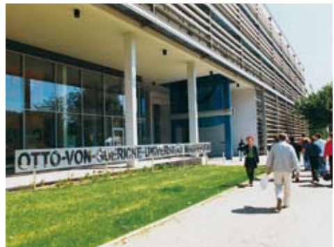
Otto-von-Guericke University Magdeburg