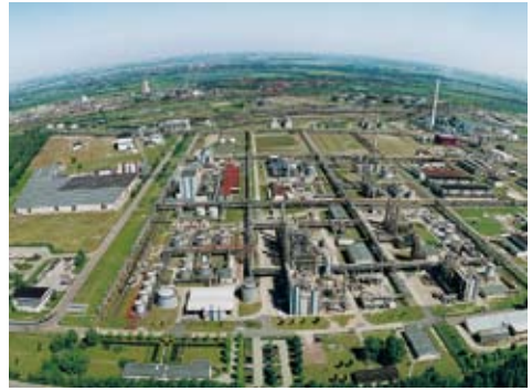
Chemical site Leuna