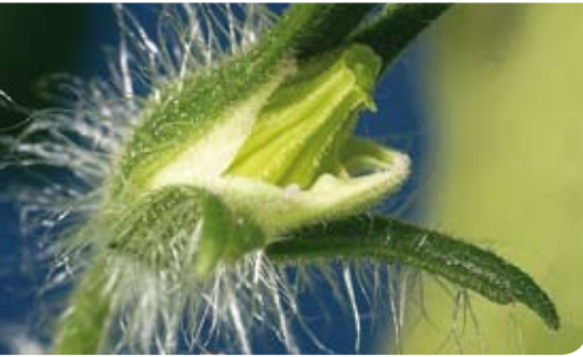
Tomato blossom at the Leibniz Institute of Plant Biochemistry, Halle (Saale)

the focus is on the technical economic optimization of telemedicine solutions and structures.